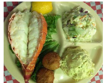
Lobster Tail Platter

Crab Trio: ½ lb. King Crab, 1 Snow Crab Cluster, 1 Crab Cake, 2 Hushpuppies and choice of 2 sides 44.99